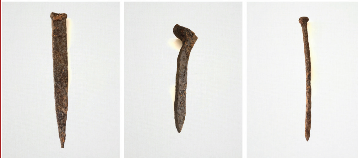
Much like your Own Constructed Significance, sculpture

Triptych questioning the temporal quality of the fasteners used to underpin our own existence, what fight?