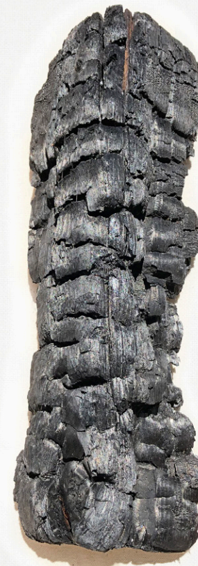
Burnout/ Self Preservation, sculpture

Burnout: a method of protecting wood through burning or charring to increase its resilience. The giving up of oneself in order to protect oneself, fight through flight.