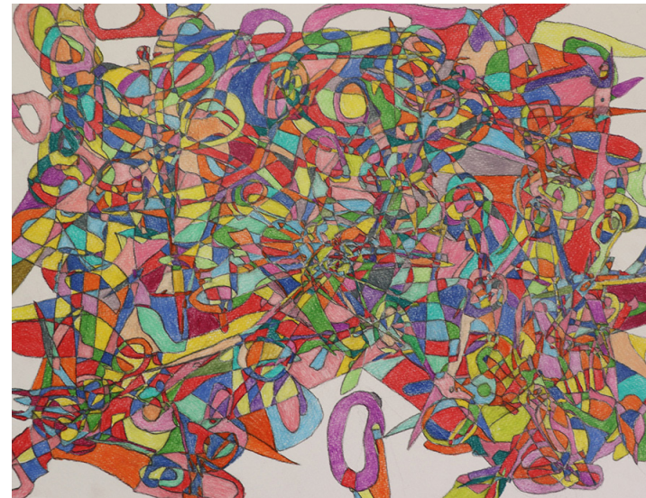
You Remember Your Birth When you Die, graphite, pencil crayon on paper, 12” x 16”