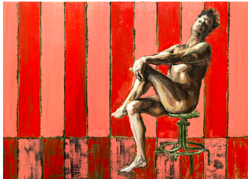
Naughty Rainbow Study, Zorn palette on panel, 12" x 16"