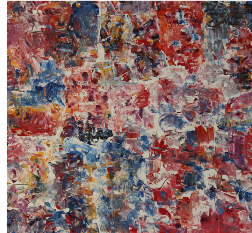
Fetal, oil on canvas, 24” x 24”