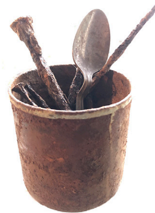
To Each Are Given, sculpture