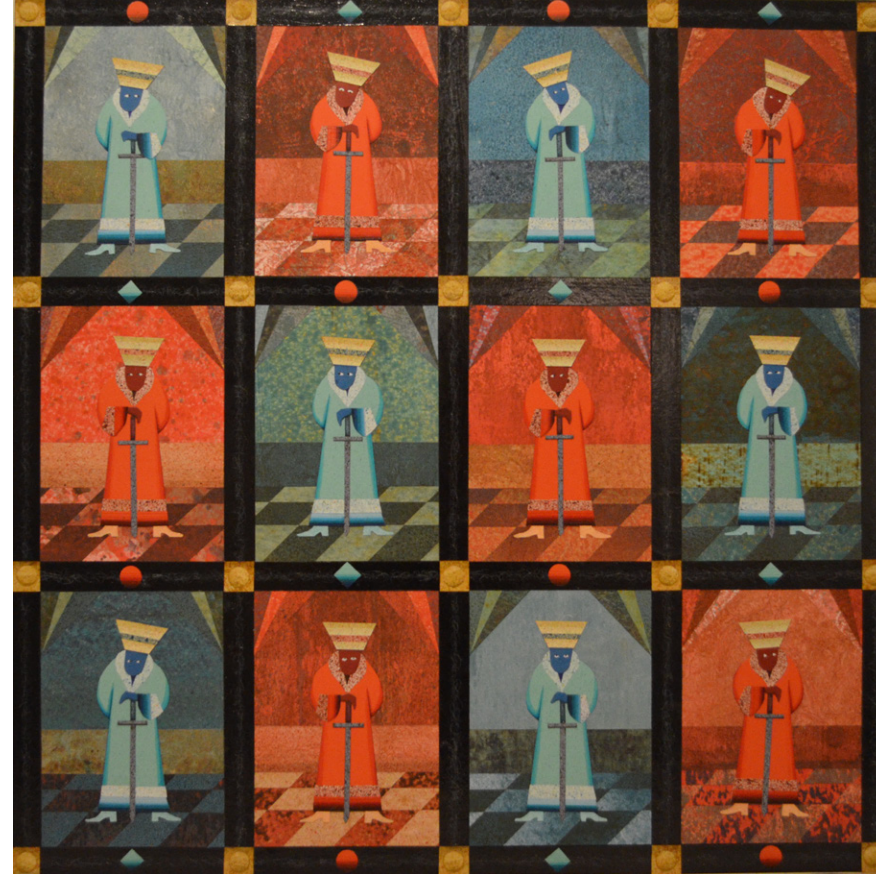
Curtains, acrylic, collage on paper, 24” x 24”