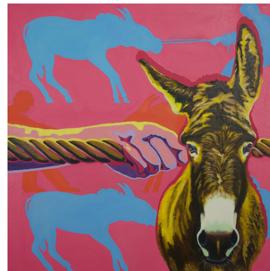
My Donkey won't Move, oil and oil stick on canvas, 24" x 24"