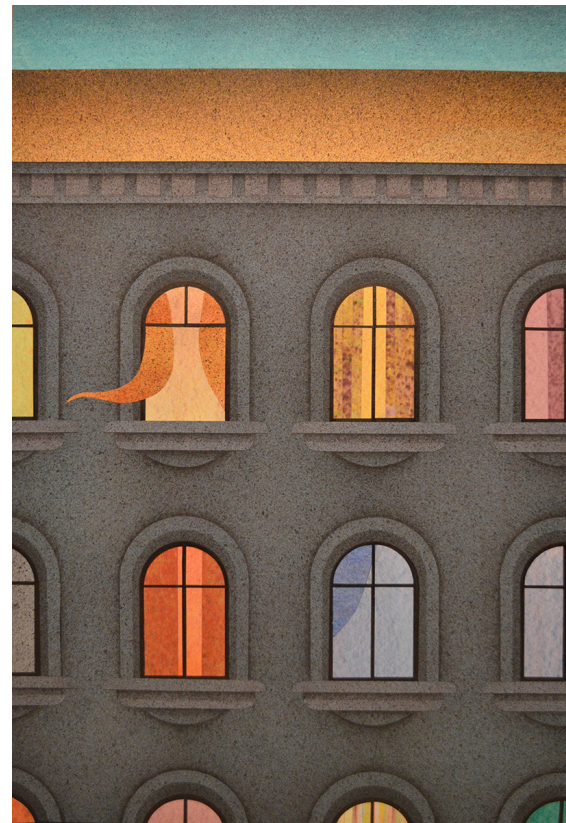
Windows, acrylic, ink, collage on paper, 68cm x 49cm