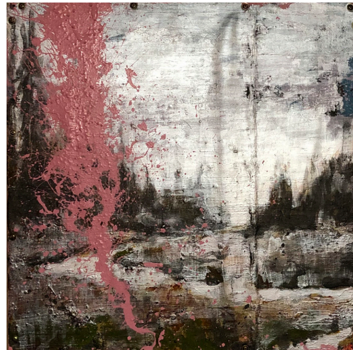
Kananaskis flourish, acrylic on wood, 24"x" 24

On this piece is an attempt to take garish and or gimmicky colours and pigments and see if I can represent the harsh wild of the deep Rockies. In a push towards abstraction, a fertile ground that I find very hard to navigate in without the greatest of fights.