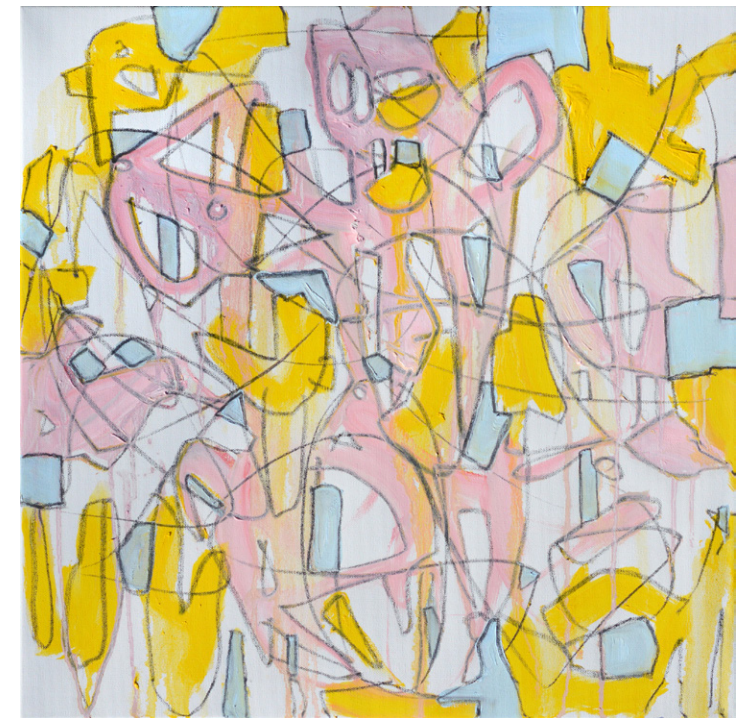
Intense Dream, oil and graphite on canvas, 24" x 24"