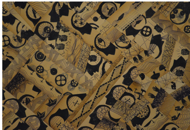
Shreds, stamp ink, pen, collage on book paper, 9” x 16”