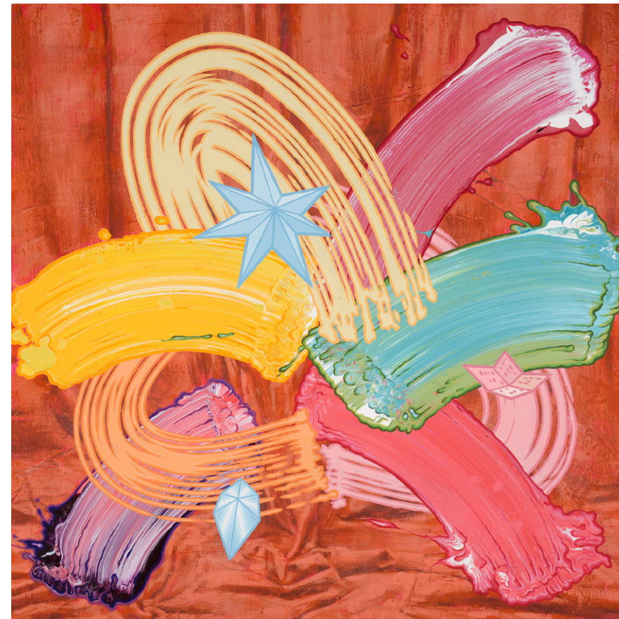
Le guide spirituel, acrylic on board, 24” x 24”

“The Empire project comes from a desire to address the issues of money and power in world culture as well as local culture and how it impacts the way artists work. It is an obvious fact for me that recent art history can be interpreted as the result of large empires justifying their importance through culture. I plan to explore the different elements that constitute painting history’s relation to money and power.”