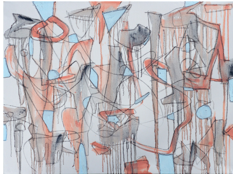
The Sky, oil and graphite on canvas, 30" x 40"