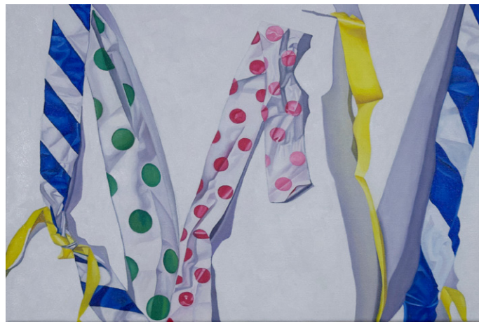
Freeze, oil on canvas, 12" x 18"