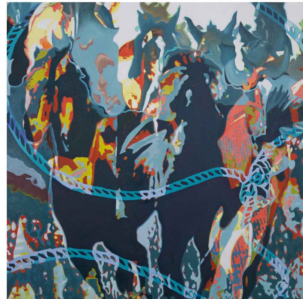
Running Scared, oil on canvas, 24" x 24"