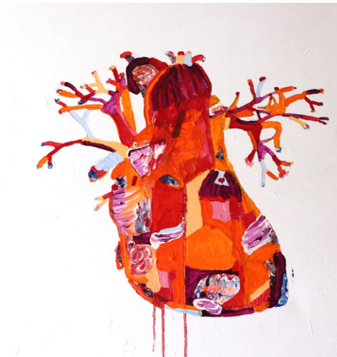
A Sacred Promise, oil on canvas, 24” x 24”

Bad decisions in relationships and the consequences of these decisions evoke a sense of fear, depression and anxiety within in me. I carry the weight of the negative feelings that surface from these fears and it effects me very deeply. In order to escape these feelings I decided to try and just stay out of relationships all together so I choose to run from theses situations these days, in the spirit of self-preservation.