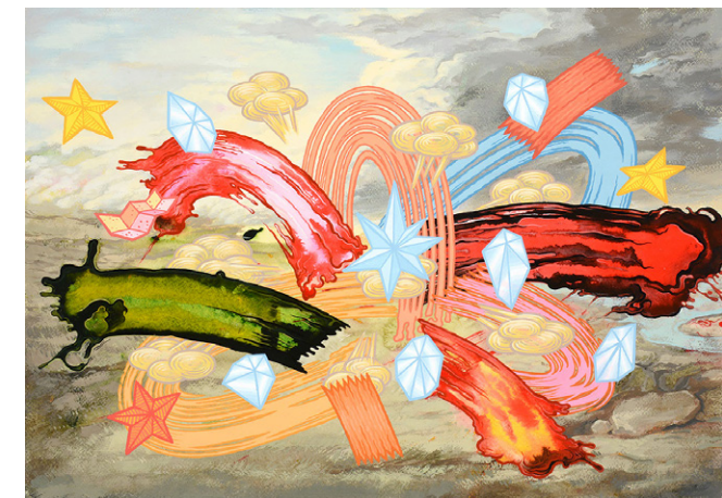
Alarum no.2, watercolour and gouache on paper, 14” x 20”